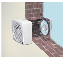
KIT MU (MURO)