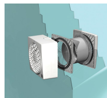
KIT FF 150/6" (DOPPIA FINESTRA)