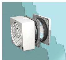
KIT VV 150/6" (DOPPI VETRI)