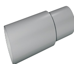
TUBO TELESCOPICO D.150 Code 22258