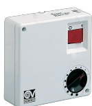
C 1.5 (COMANDO EL. 1.5 A) Code 12966