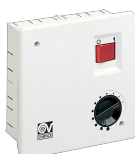
SCNRB SCAT.COM.NON REV.INCASSO Code 12971