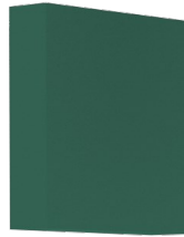
2FTR-H14- DEPURO PRO 150