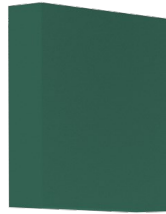
2FTR-H14- DEPURO PRO 300