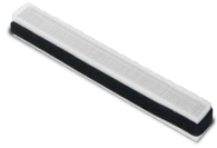
FTR EPM1 55% (F7) 418X44X21 Code 21626