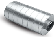
NA 160 PHI Code 21643