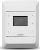
CB LCD D Code 21381