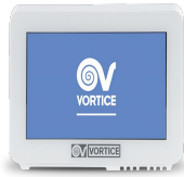
CB TOUCH LCD W Code 21933