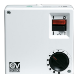
SCNR5 UNIF.X NK SOFFITTO