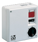
SCNR5 UNIF. X NK SOFFITTO